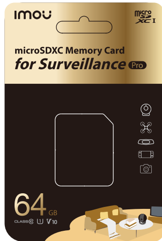
Front of the package